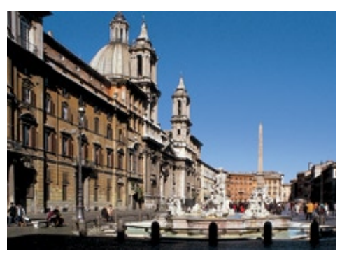
Rome, piazza Navona