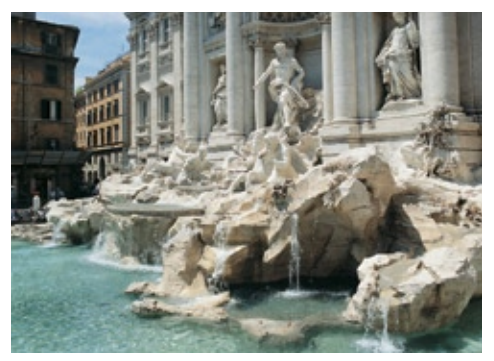
Rome, the fountain of Trevi