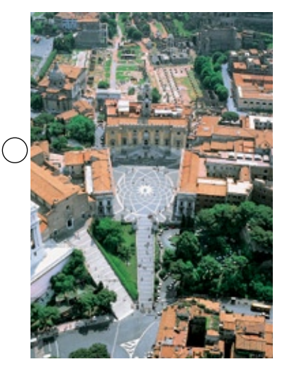
Rome, the Capitoline Hill

HISTORIC CENTRE OF ROME • The possible itineraries in Rome are potentially infinite, but if you have to choose, there is no place to begin other than the city's universally recognized symbol: the Colosseum. Built in eight years by the dynasty of the Flavian emperors, its real name was the Flavian Amphitheatre and it was the largest site dedicated to theatre and games in those days of antiquity. Along the road that connects the Colosseum to Piazza Venezia, you will see the ruins of the Imperial Forum and the Roman Forum. This is where the ancient Romans had the centre of public life, where the political, religious and business activities were concentrated. Continuing on towards Piazza Venezia, we reach the Vittoriano, which is a monument to Vittorio Emanuele II. At the centre of the majestic construction is the National Altar, and the Tomb of the Unknown Soldier dedicated to all those who have given their lives in war.