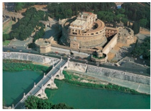
Rome, Castel Sant'Angelo